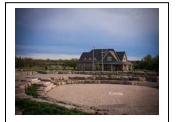
Administration Building Outdoor Amphitheatre