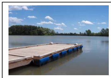
Lake Niapenco Fishing, Kayaking, Canoeing