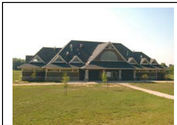
688 Capacity Pool Complex Washrooms & Change Rooms