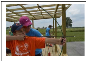
Outdoor Archery Range