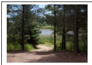
35 acres located on Lake Niapenco

Welcome to Marydale Park. Located between Mount Hope and Binbrook, Onatrio, this brand new, fully accessible, outdoor recreation facility sits on 35 acres of land bordering the Binbrook Conservation Area's Lake Niapenco, a 430 acre reservoir. Marydale Park offers a wide range of barrier-free programs and outdoor activities, making us the perfect choice for your school trips and outdoor education programming. Take a look at what our facility has to offer: