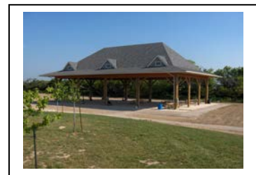
533 Capacity Recreational Pavilion