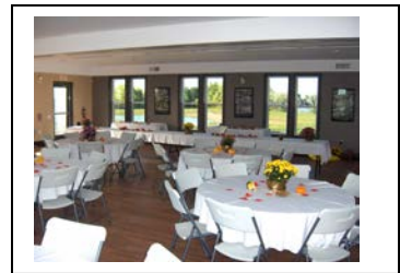
120 Capacity Community 'Great' Room